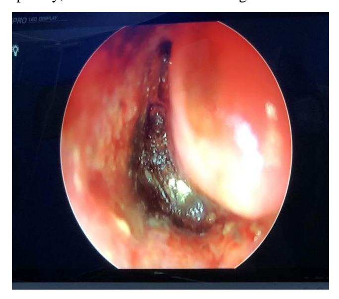
Figure 2: On Endoscopic visualisation, the button battery surrounded by crusting present which was stuck between the septum and middle turbinate.

gauze and the child tolerated the procedure well. The child was started with intravenous antibiotics and analgesics. The nasal pack was removed after 24hours and was discharged on the next day with oral medications and saline nasal spray. The patient was told to follow up after a week. On follow up of 2 weeks extensive crusting within left nasal cavity was noticed. It was cleared endoscopically, after which mucosal healing was noticed.