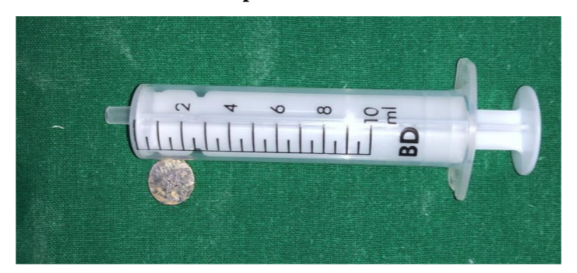
Figure 3: The button battery removed from left nasal cavity.